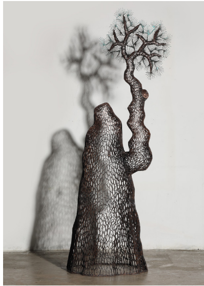
Lee Gil Rae, Old Pine Tree 2019-6, 2019, copper welding, 225 x 89 x 72 cm | 88.6 x 35 x 28.3 in

Aggregation series is characterised by wall-hung amalgamations of small, triangular forms wrapped in Hanji paper often tinted with teas and pigment.